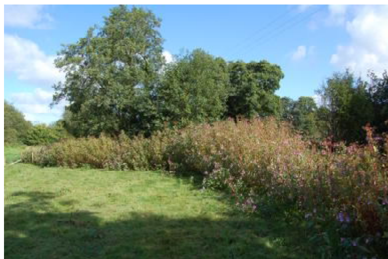
An abundance of Himalayan Balsam along the riverbank

The main improvement to the flora of the site would be removal of the invasive alien species Japanese Knotweed and Himalayan Balsam. Japanese Knotweed is currently only a small problem with a few clumps along the Nant Bargod, but could soon become well established and difficult to eradicate. Himalayan Balsam is already dominant along the Nant Bargod and may be excluding other species; it could be reduced by repeatedly pulling up young plants in the spring before they seed, but it would re-establish from seed elsewhere along the riverbanks in the area.