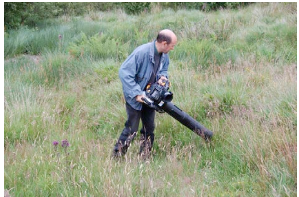
Figure 4. Using a suction sampler