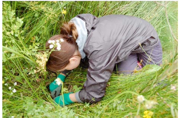
Figure 3. Looking in the rushes by the side of the pond on the northeast corner of Coity Tip