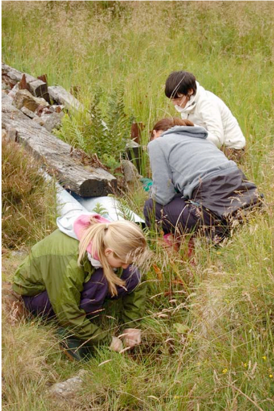
Figure 2. Searching in grassland in a flush