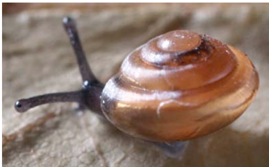
Figure 8. Tawny glass snail – Euconulus ( Euconulus ) fulvus