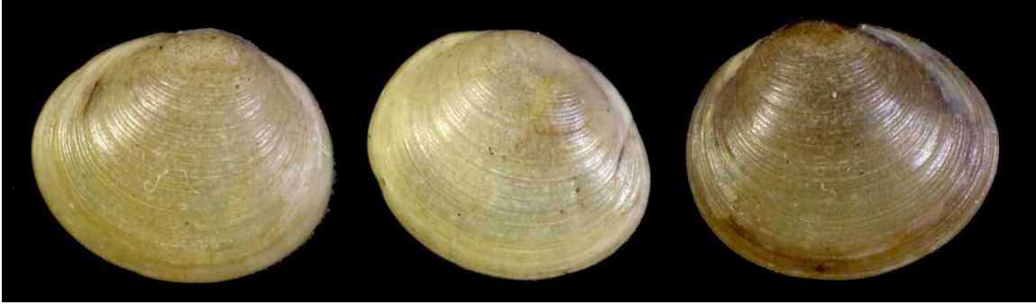
Figure 10. Various species of the genus Pisidium

Although I have not been able to ascertain the particular species, I think it is most likely to be Pisidium personatum or P. casertanum . Both are common, widespread and native, and often found in association with one another. It is most likely to be one or both of these species as they are the most tolerant of habitats that are at high elevations and that are subject to dessication. It was interesting to find them as the flush they were living in was completely dry, indicating that they seem to be able to tolerate prolonged spells of dessication.