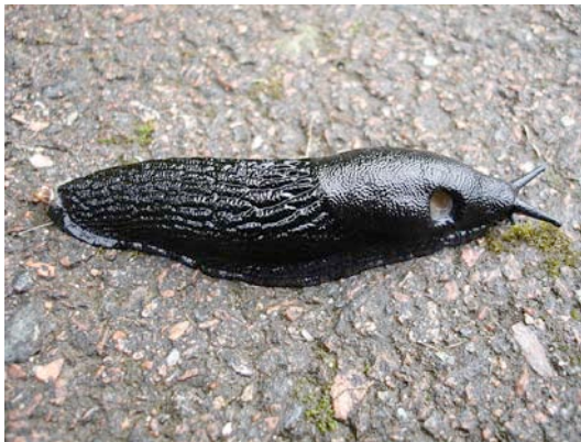
Figure 6. Large black slug – Arion ( Arion ) ater

A number of the species found are indicative of this acidic upland environment such as Arion ( Arion ) ater (Large black slug), Arion ( Kobeltia ) intermedius (Hedgehog slug), Euconulus ( Euconulus ) fulvus (Tawny glass snail) and Discus ( Gonyodiscus ) rotundatus rotundatus (Rounded or radiated snail).