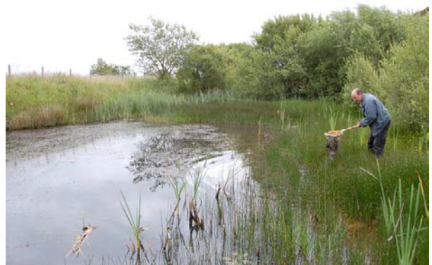
Figure 5. Pond dipping in the standing water on the on the northeast corner of Coity Tip