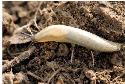
Figure 7. Hedgehog slug – Arion ( Kobeltia ) intermedius