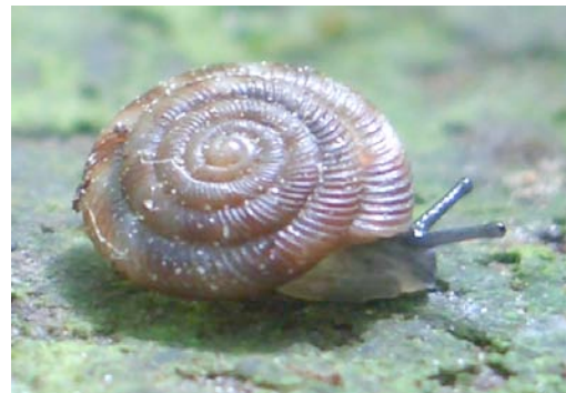
Figure 9. Rounded or radiated snail – Discus ( Gonyodiscus ) rotundatus rotundatus

We found a large accumulation of bivalve molluscs of the genus Pisidium from a hillside flush in one of the main areas of marshy grassland and soft rush flushes. Pisidium is a genus of very small freshwater clams known as pill or pea clams.