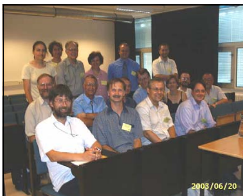
IGCP 469 Team at International Congress on Carboniferous and Permian Stratigraphy, Utrecht (August, 2003).

The IGCP part of the Congress fell in to two parts. Firstly, there was a Business Meeting,