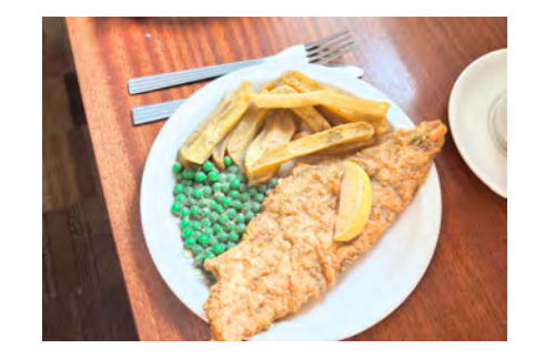
Fish and chips